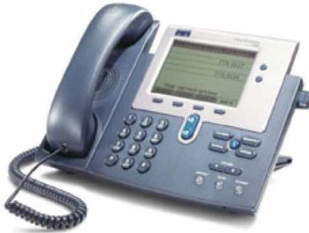
Figure 1. Cisco IP Phone 7940G

The Cisco IP Phone 7940G, a key offering in the IP Phone portfolio, addresses the communication needs of a transaction type worker. It provides two programmable line and feature keys, plus a high quality speakerphone. The Cisco IP Phone 7940G also has four dynamic soft keys that guide users through call features and functions. Built-in headset port and integrated Ethernet Switch are standard with the Cisco IP Phone 7940G. Also includes audio controls for full duplex speakerphone, handset and headset. The Cisco IP Phone 7940G also features a large, pixel-based LCD display. The display provides features such as date and time, calling party name, calling party number, and digits dialed.